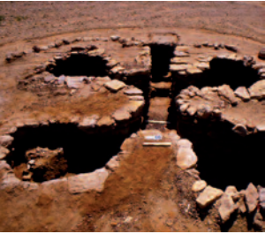
A subterranean tomb dates to the second millennium at Jebel al-Buhais.

Archaeological research undertaken at the extensive Iron Age settlement at Muwailah, near Sharjah International Airport, highlights Muwailah's role as a centre for pottery production and exchange within the region and at an inter-regional level.