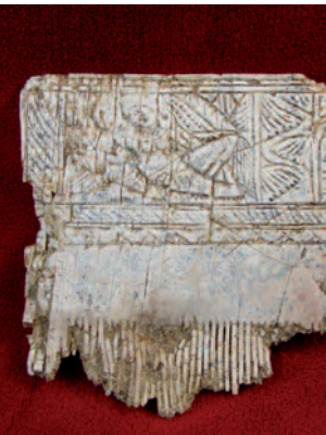
An ivory comb from Dibba, first century AD.

Elsewhere in Umm al-Qaiwain, much of the coastline of the Khor al-Beida lagoon has been affected by recent residential development, with the loss of a number of areas of archaeological interest, and with developers showing little interest in preserving, or even investigating, known sites. One by-product of the development programme, however, was the cutting of a large section through a sand dune that exposed a Neolithic graveyard site