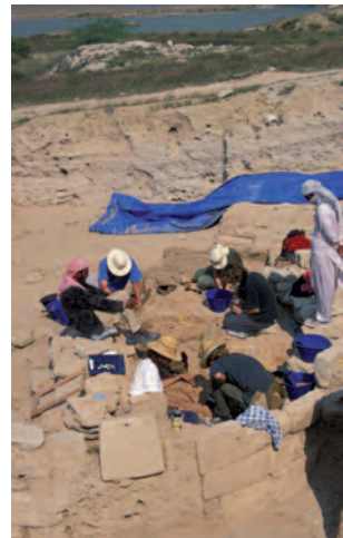
The site of Tell Abraq was occupied for over 3000 years, from the early Bronze Age to the beginning of the Christian era.

Residential development in Umm al-Qaiwain exposed a Neolithic graveyard site which, along with the site at Akab, has shed some light on the UAE's 'Dark Millennium'.