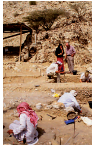
Excavations under way at Jebel al-Buhais. (Dr Sabah Jasim)

Tools similar in type to other artefacts known to be of Upper Pleistocene age, or the Middle and Upper Palaeolithic, from Oman and the Horn of Africa, suggest that there may have been a 'Southern route out of Africa' across the southern and eastern Arabian Peninsula, through which early man spread into Asia.